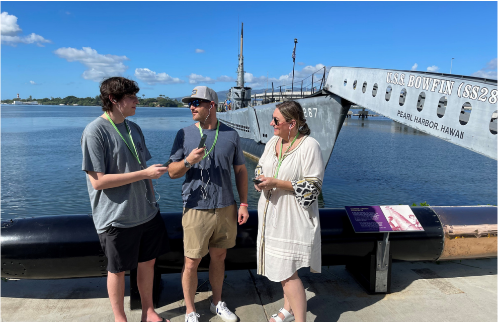
Visitors use the SC600 Minis at USS Bowfin.