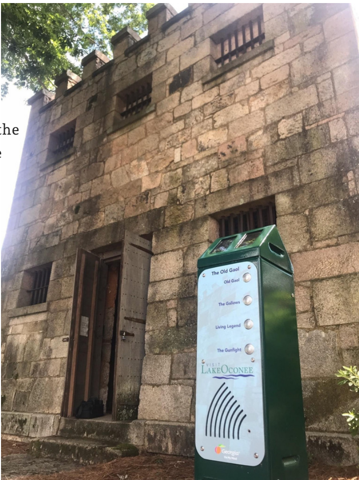
The Old Gaol Jail. Photo courtesy of Greensboro Historic Rural Church Trail

https://visitlakeoconee.com/business-category/history-culture/