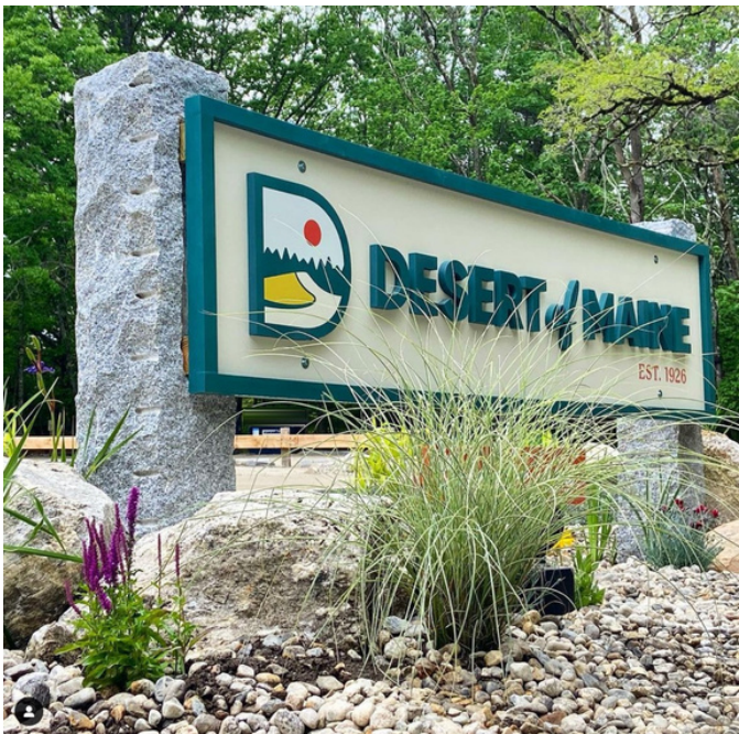
Desert of Maine.

The Desert of Maine is located in the town of Freeport, Maine and consists of 40 acres of glacial sand dunes that are surrounded by a coastal forest. The Desert of Maine features many attractions and exhibits such as the Gemstone Village, the Historic Tuttle Farm as well as a number of nature trails. Management was looking to add interpretation to the existing physical signage on its nature trails. To incorporate audio as a part of the nature trail experience, the Desert of Maine purchased a number of Tour-Mate's Solar Sign Kits. The Solar Sign Kit is a solar powered eco-friendly audio platform that can be incorporated into new or existing outdoor interpretive and wayfinding signage. It effectively converts any existing sign into a 'talking sign'. The kit is designed to withstand extreme weather conditions, making it the perfect solution for the Desert of Maine.