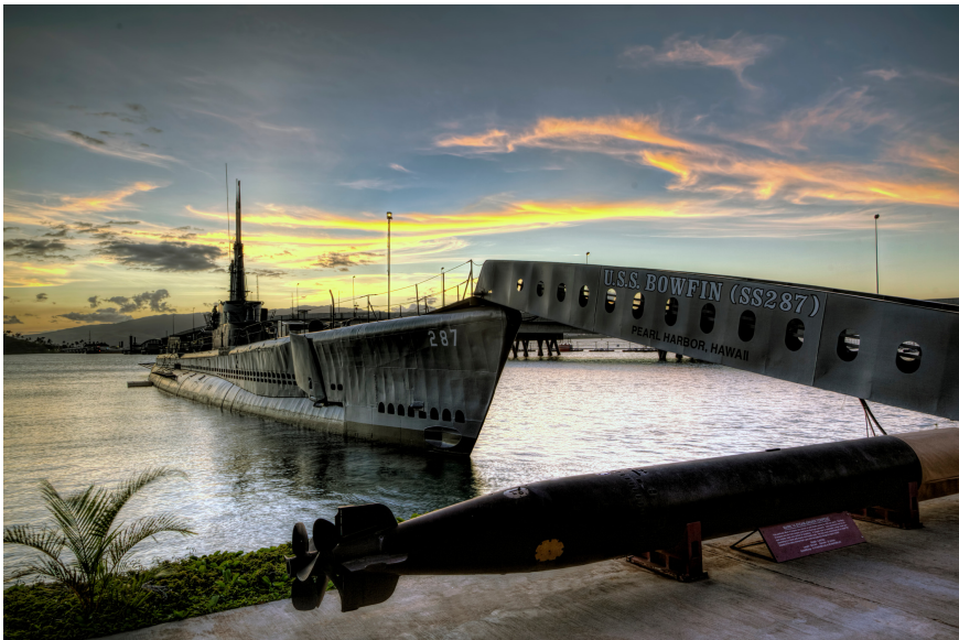
The USS Bowfin.

Nicknamed the ‘Pearl Harbor Avenger,’ the USS Bowfin was officially launched one year after the attack on Pearl Harbor. Credited with sinking 44 ships during WWII, the Bowfin ranked 15th among 188 submarines in the US WWII fleet. It appropriately deserves being named after the aggressive and voracious fresh water fish - the bowfin. After serving in the Korean War, the submarine was officially decommissioned in December 1971, and returned to Pearl Harbor as a memorial. In 1986, the Bowfin was declared a National Historic Landmark. The Bowfin is now a part of the Pacific Fleet Submarine Museum Association (PFSMA), providing visitors to Pearl Harbor with indoor and outdoor exhibits, as well as tours of the submarine itself.