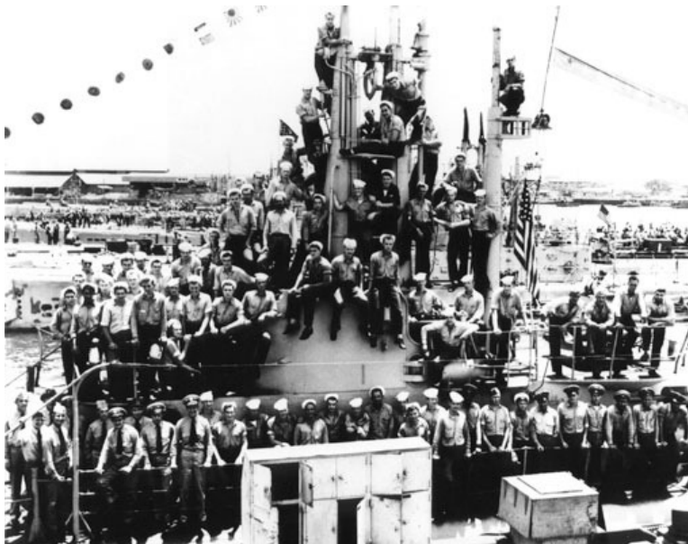
The USS Bowfin Crew Upon Return Home from Patrol 9, 4 July 1945.

If you want to learn more about visiting the USS Bowfin and stay updated on the construction and tour process, please visit https://www.bowfin.org