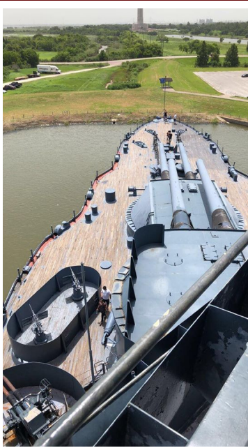
Aerial View of the USS Texas.

Just outside of Houston in La Porte, Texas is the first U.S. battleship to be designated as a floating museum and to be declared a U.S. National Historic Landmark. Commissioned in 1914, the 573 ft USS Texas (BB-35) is the last remaining battleship to have participated in both the First and Second World Wars.