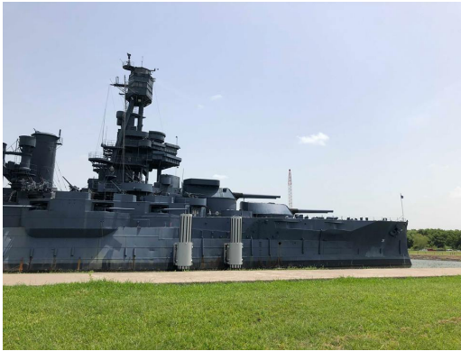
Exterior View of the USS Texas.

As a result, the USS Texas needed an interpretive solution for its visitors. Tour-Mate was selected to create and produce Adult and Family audio tours in both English and Spanish. The tours will be delivered on the SC600 Mini Audio Wand system.