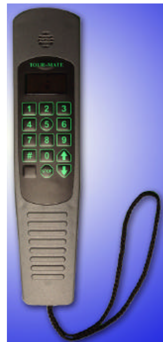
SC 550 Wand donated to the Ground Zero Museum Workshop