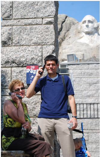
Visitors using the SC550 audio wands.

To learn more about the self-guided tours available at the Mount Rushmore National Memorial, please visit: http://www.mountrushmoresociety.com/124/audio-tour-landing.htm