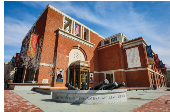
Exterior view of the MAR.

One of the most important interpretational considerations for MAR when deciding to create a tour was ensuring that the Museum's varied and unmatched collection of Revolutionary-era artifacts was accessible to all guests. Hence the selection of Tour-Mate's SC600 Listening Wand System, an accessible option for delivering a more thought-provoking experience in the Museum's core exhibition area. Tour-Mate provided a select quantity of SC600 Wands equipped with a braille keypad for visitors with visual impairments.