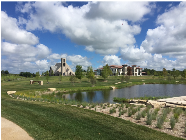
Exterior view of Cloisters on the Platte.

After a few rounds of consultation, research, and development, Tour-Mate presented Cloisters with the SC600 Mini Listening Wand with a custom keypad, headphone jack, and triggered messaging to encourage the most serene tour experience possible. When guests approach within a few feet of any station, the audio content for that station begins playing automatically. Guests may pause the playback or choose to restart the current track with the newly introduced replay button.