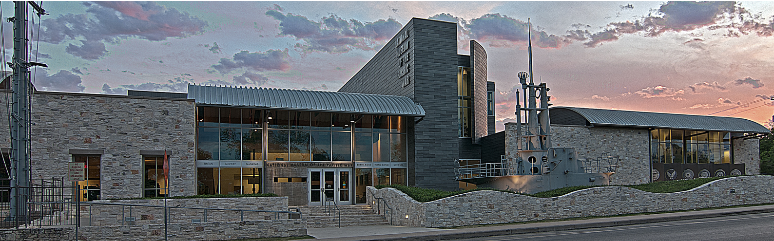
Exterior View of the National Museum of the Pacific War.