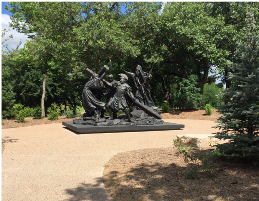
One of the re-creations of the Stations of the Cross at Cloisters on the Platte.

Opening in July 2018, The Cloisters on the Platte retreat is located on the Platte River outside Omaha, NE and features seven guest lodges situated on 931 acres. The grounds boast multiple lakes and nature trails as well as the main attraction: a 2,500 ft long re-creation of the Stations of the Cross featuring 14 hand-fashioned, larger than life sculptures.